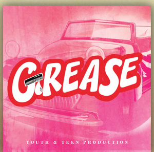
MAY 10 - 19