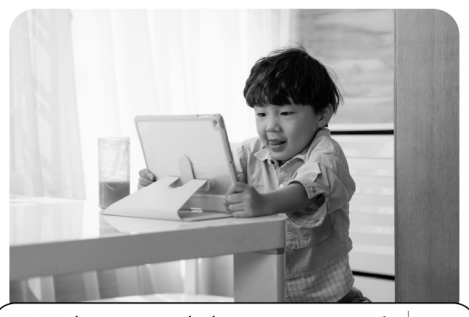
Q What sound does a cow make