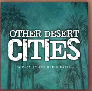
DECEMBER 6 - 15