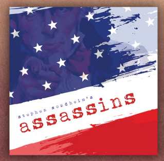
OCTOBER 25 - NOV. 3