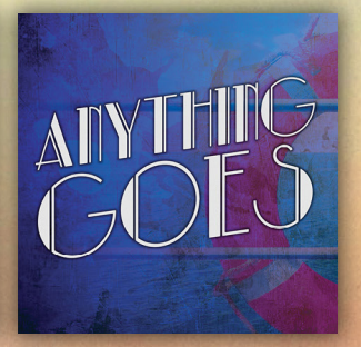
JULY 26 - AUGUST 4